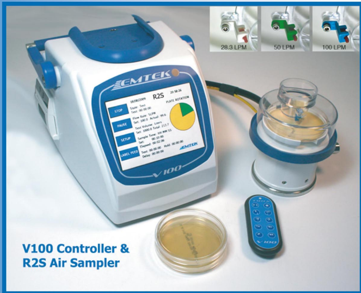
V100 Controller & R2S Air Sampler

The EMTEK Versatile 100 (V100) Air Sampler Controller offers a high level of versatility for microbial air monitoring of Critical Environments and Systems.