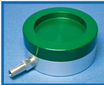
50 LPM (Green)