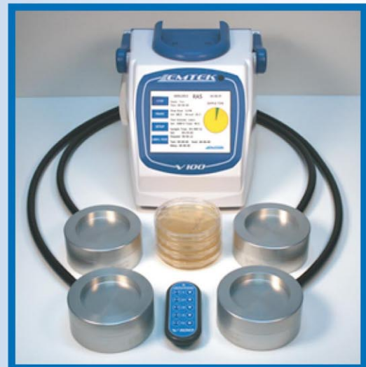
V100 & 4 x RAS @ 28.3 LPM