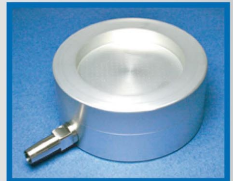
28.3 LPM (Clear)

Contact EMTEK or your local area representative for additional product information and pricing. TEL 877.850.4244 sample@emtekair.com www.emtekair.com