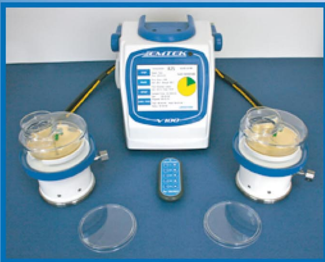
V100 & R2S Dual @ 50 LPM

The V100 can operate two (2) R2S or RAS samplers at the same time at a sampling rates of 50 LPM, and four (4) R2S or RAS samplers at 28.3 LPM. Ask your sales representative for details.